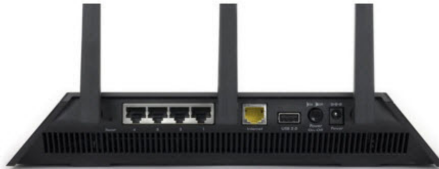
Your Third Party Router